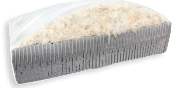
Primalux Jacket Cushion

with Vita Talaly Latex core and 100% duck feather jacket