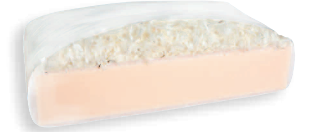
Primalux Jacket Cushion

Primalux produced by The Vita Comfort UK allows you to configure your own product series based on your requirements. With numerous options for customisation, you are able to develop a unique and durable product for you and your customers.